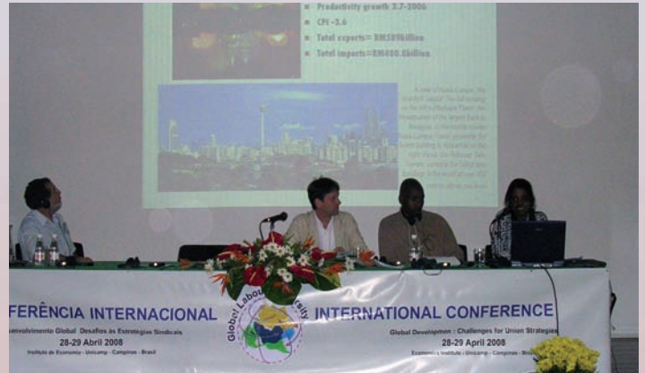
2008 GLU Conference, “What Ladder? What Tree? Global Development: Challenges for Union Strategies”, Campinas, Brazil.