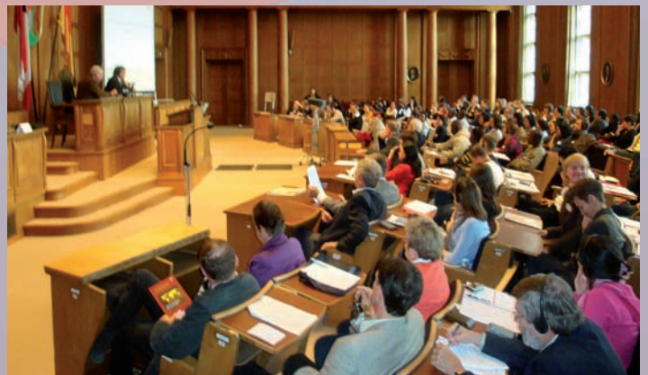
2010 GLU conference – “Sharing the burden! Shaping the future? – labour responses to the global crisis”, Berlin, Germany

To strengthen the debate and research around the social dimension of globalisation and the Decent Work agenda, the GLU became a key partner in the newly established International Research Centre on Development and Decent Work (ICDD). Strongly based on the GLU network and funded by the German Academic Exchange Service, the ICDD offers an international PhD programme located within 6 universities in the South and the University of Kassel in Germany.