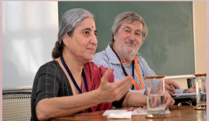
2009 GLU Conference “Financialization of Capital – Deterioration of Working Conditions”, Mumbai, India.

A short term Diploma Course on Labour Policies and Globalisation that was designed for those trade unionists who are not able to take an entire year off for the Master’s programme, but who still stand to benefit from the quality and specificity of the GLU curriculum. ENGAGE integrates practice with theory by including an 8 week internship with a trade union. During the programme, students partner with a national or international trade union center to develop policy projects that will be implemented when they return home.