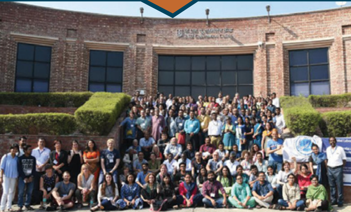
XII Global Labour University Conference 2017 JNU, New Delhi